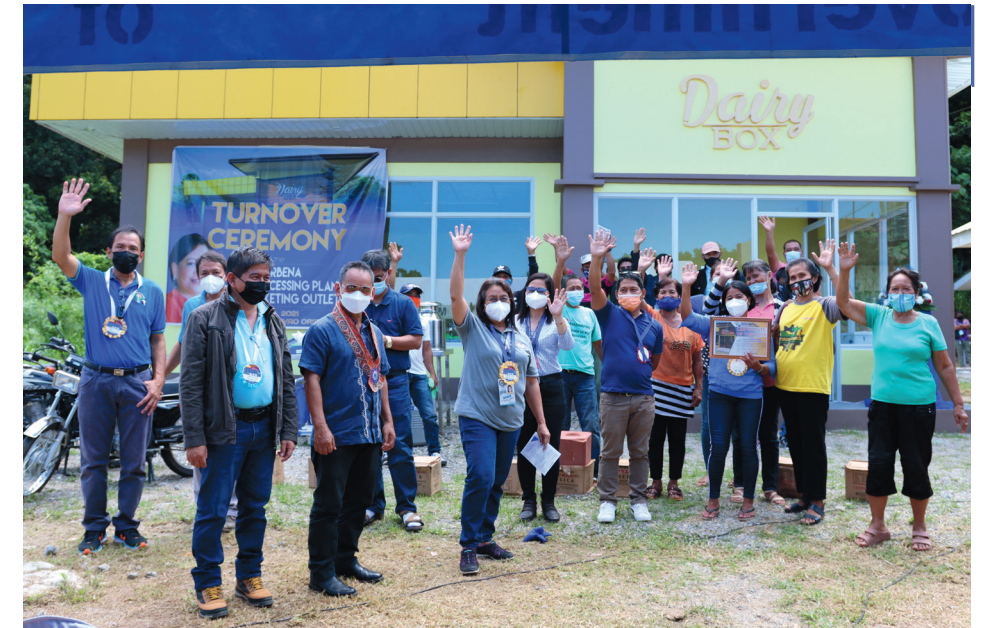
Members of KARBENA happily show off the certificate for the new dairy processing plant and marketing outlet awarded to them by the DA-PCC under the ALAB-Karbawan project.

In an interview, City Mayor Michelle Rabat gave assurance to the farmers that they have the full support from the city government of Mati