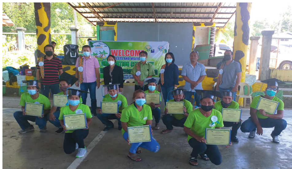
CCDP project stakeholders from Makilas and Tomitom, Ipil, Zamboanga Sibugay completed the 11-week Cara-Aralan sa Niyugan.

Through a joint project of DA-Philippine Coconut Authority (DA-PCA) and DA-Philippine Carabao Center called Coconut-Carabao Development Project (CCDP), the One DA's reform agenda on diversification is being implemented in select areas in Mindanao.