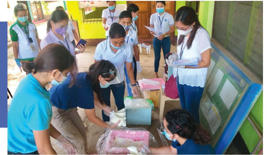
LGU and DSWD Regional Office milk feeding focal persons inspect the milk products delivered by the cooperative.

The DSWD coordinated with DA-PCC to link them with local dairy producers and cooperatives where