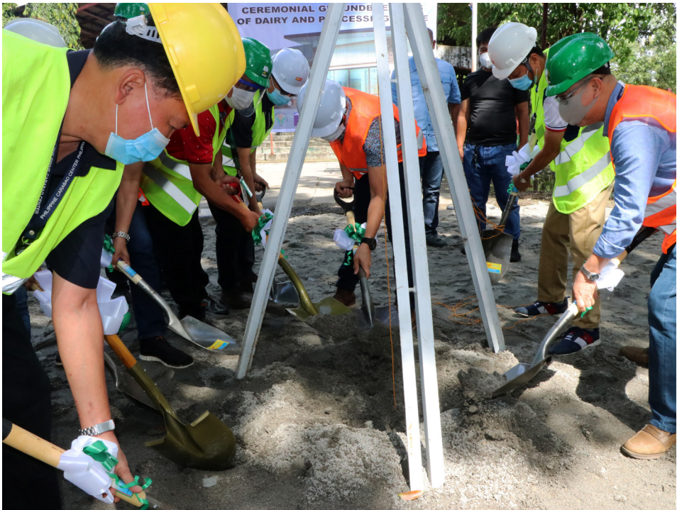
Select DA-PCC, LGU-Victoria and Tarlac province execs lead the groundbreaking of the dairy and processing store in Victoria, Tarlac.

The town of Victoria in Tarlac will soon add the processing of dairy products with carabao’s milk to its roster of livelihood opportunities for the town’s residents. A ceremonial groundbreaking of dairy and processing store and entrustment of production, processing, and marketing equipment were conducted last October 27 at the Bulwagan ng Kalayaan in Victoria.