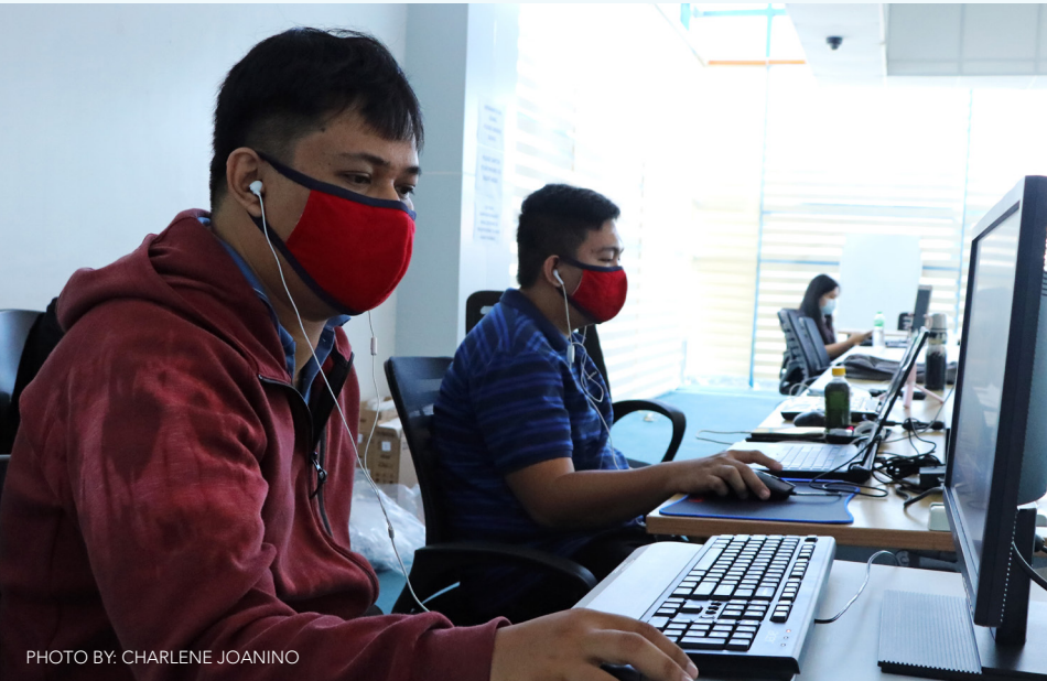
DA-PCC staff members facilitate the online 5 th International Livestock Biotechnology Symposium with the theme “Research-Driven Innovations Addressing and Mitigating the Impacts of Global Pandemic in the Livestock Industry”.

The DA-PCC recently underscored research-driven innovations to address and mitigate the impact of the pandemic in livestock during an international symposium held last October 27-28.