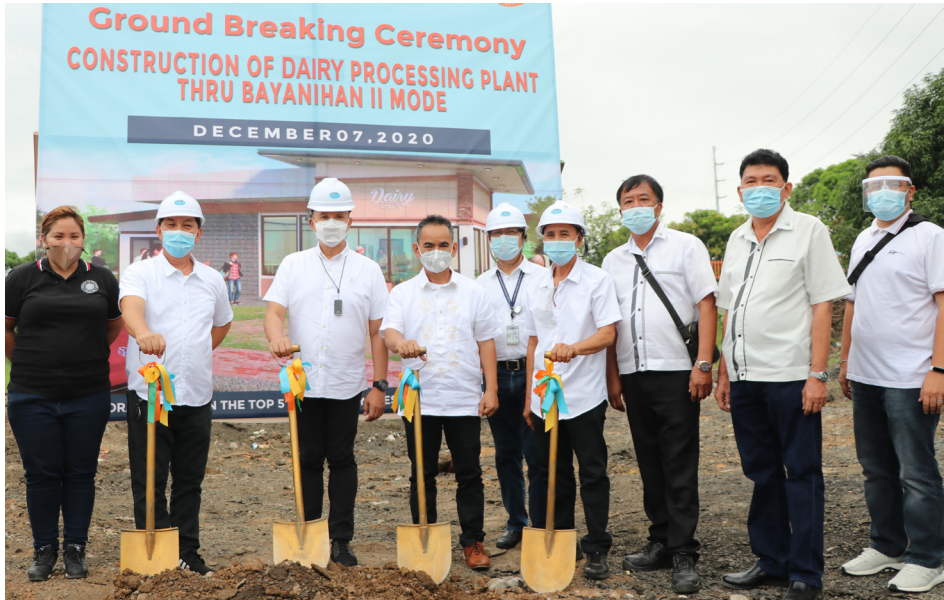
Some of the top officials of DA-PCC and LGU-Orani leading the groundbreaking ceremony of the new dairy processing plant and store held at Orani, Bataan.

Business opportunities and a sure market for milk are soon to benefit carapreneurs in Bataan following the groundbreaking ceremonies for the establishment of a 300 sq m dairy processing plant and outlet in Orani last December 7.